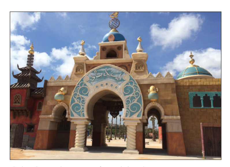
The themed entrance by TAA, as seen from inside the park