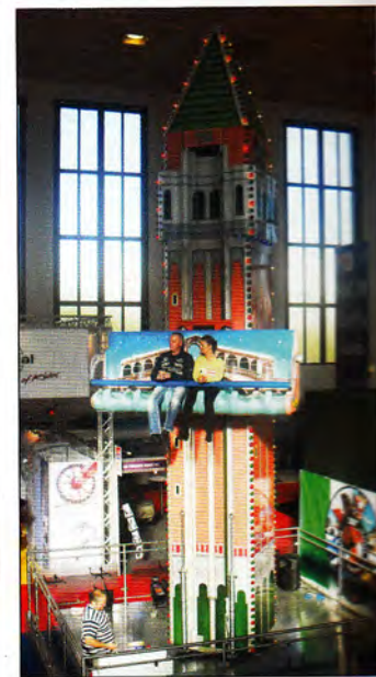
Italian manufacturer EOS exhibited this Venetian-themed tower ride