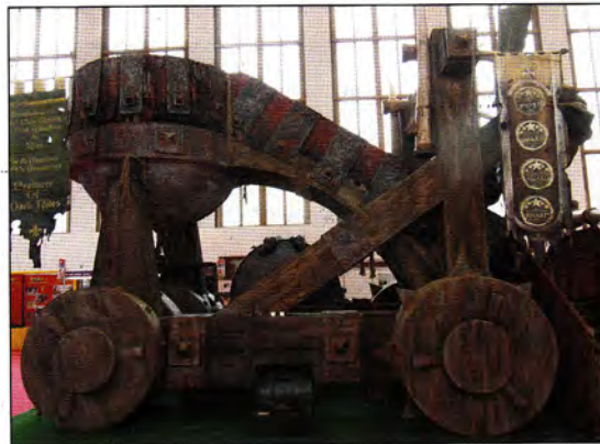
Theming and Animatronics Industries (TAA) made an effort!

Exhibitors and visitors alike will be relieved that next year's Euro Attractions Show – in Paris – is scheduled for September as the five week gap between the Berlin event and IAAPA Attractions Expo in Orlando was a little too close for comfort. Nevertheless the growth of EAS, in both size and stature, makes the need to visit both shows unnecessary. With both travel budgets and work schedules under pressure in the current climate,