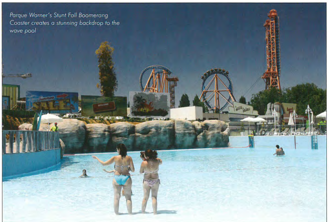
Parque Warner's Stunt Fall Boomerang Coaster creates a stunning backdrop to the wave pool

blog.parquewarner.com/parque-warner-beach