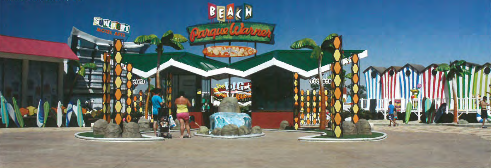
The themed entrance by TAA